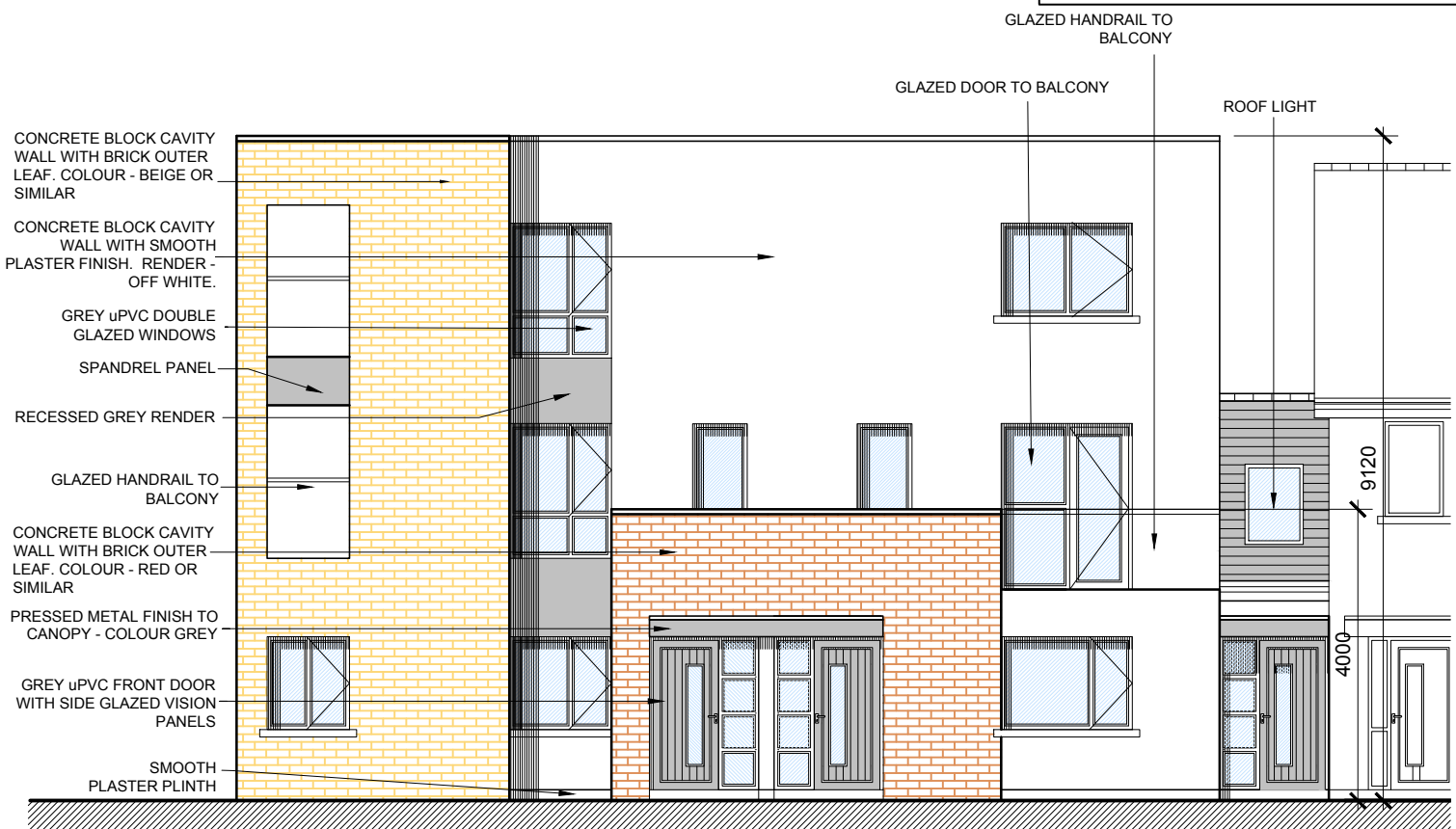
FRONT ELEVATION SCALE 1:100 @ A3 APARTMENT BLOCK F4.2