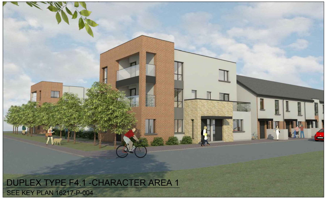
DUPLEX TYPE F4.1 - CHARACTER AREA 1 SEE KEY PLAN 16217-P-004

NOTE: POSITION OF NORTH POINT AND LEVELS VARIES - CHECK SITE PLAN FOR ORIENTATION AND F.F.L'S - DWG NO. 16217/P/003.