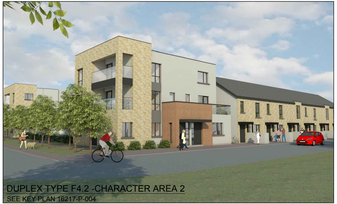
DUPLEX TYPE F4.2 - CHARACTER AREA 2 SEE KEY PLAN 16217-P-004