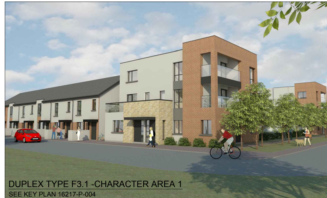
DUPLEX TYPE F3.1 - CHARACTER AREA 1 SEE KEY PLAN 16217-P-004

NOTE: POSITION OF NORTH POINT AND LEVELS VARIES - CHECK SITE PLAN FOR ORIENTATION AND F.F.L'S - DWG NO. 16217/P/003.