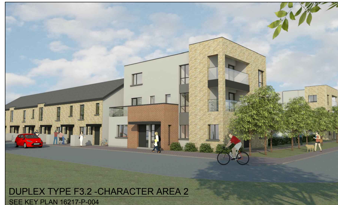
DUPLEX TYPE F3.2 - CHARACTER AREA 2 SEE KEY PLAN 16217-P-004