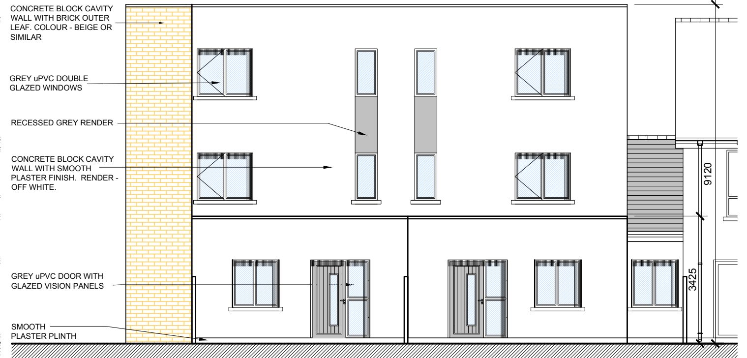
REAR ELEVATION SCALE 1:100 @ A3 APARTMENT BLOCK F1.2