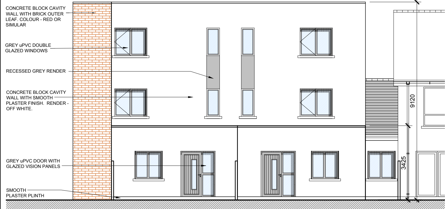
REAR ELEVATION SCALE 1:100 @ A3 APARTMENT BLOCK F1.1

DO NOT SCALE. WORK TO FIGURED DIMENSIONS ONLY. ALL EXISTING DIMENSIONS TO BE CHECKED ON SITE. DRAWN ON AUTOCAD R2004 AT DEADY GAHAN ARCHITECTS LTD LAYERS ON THIS DRAWING COMPLY WITH BS 1192: PART 5