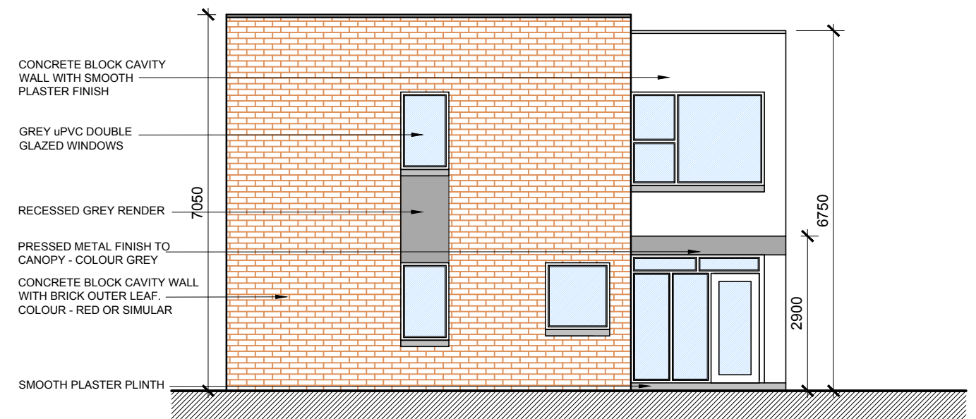
WEST ELEVATION (FRONT)