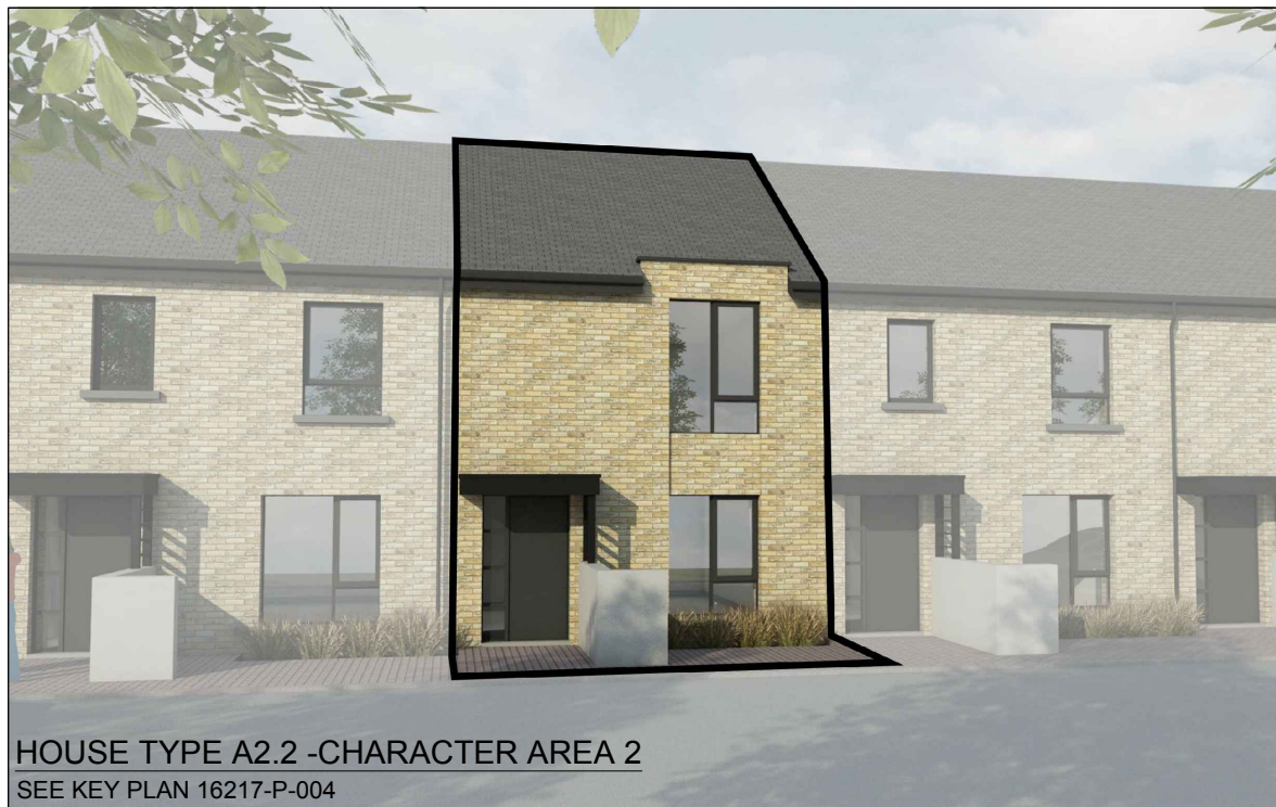
HOUSE TYPE A2.2 - CHARACTER AREA 2 SEE KEY PLAN 16217-P-004

HOUSE TYPE A2.1 / A2.2: 80.5 SQ.M 866.5 SQ.FT