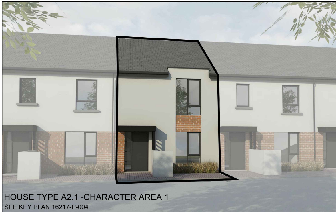
HOUSE TYPE A2.1 - CHARACTER AREA 1 SEE KEY PLAN 16217-P-004